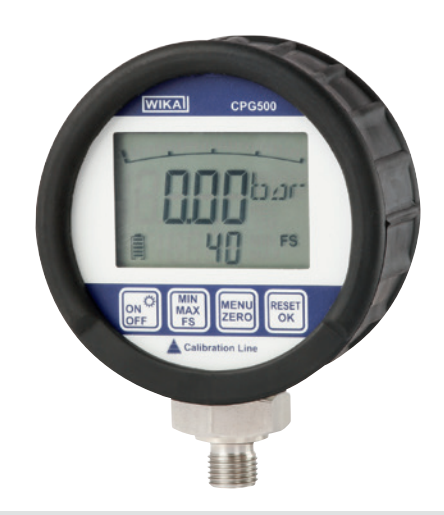
Digital pressure gauge model CPG500